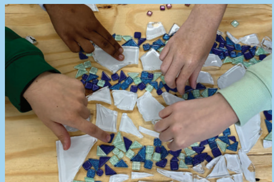
The 2021-22 collective art project is a large mosaic. Literally and figuratively, everyone had a hand in creating this beauty.