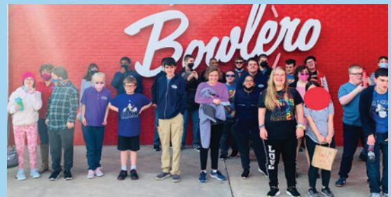
Bowling fun thanks to Special Olympics!