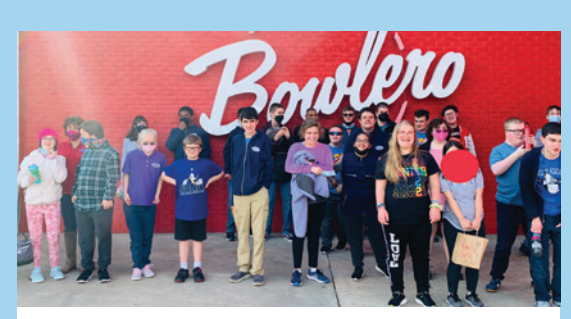
Bowling fun thanks to Special Olympics!