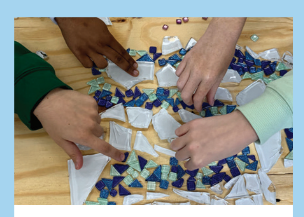
The 2021-22 collective art project is a large mosaic. Literally and figuratively, everyone had a hand in creating this beauty.